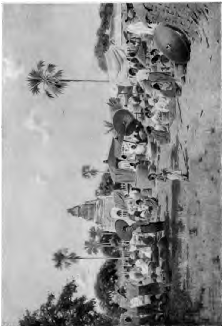
THE MARKET PLACE.